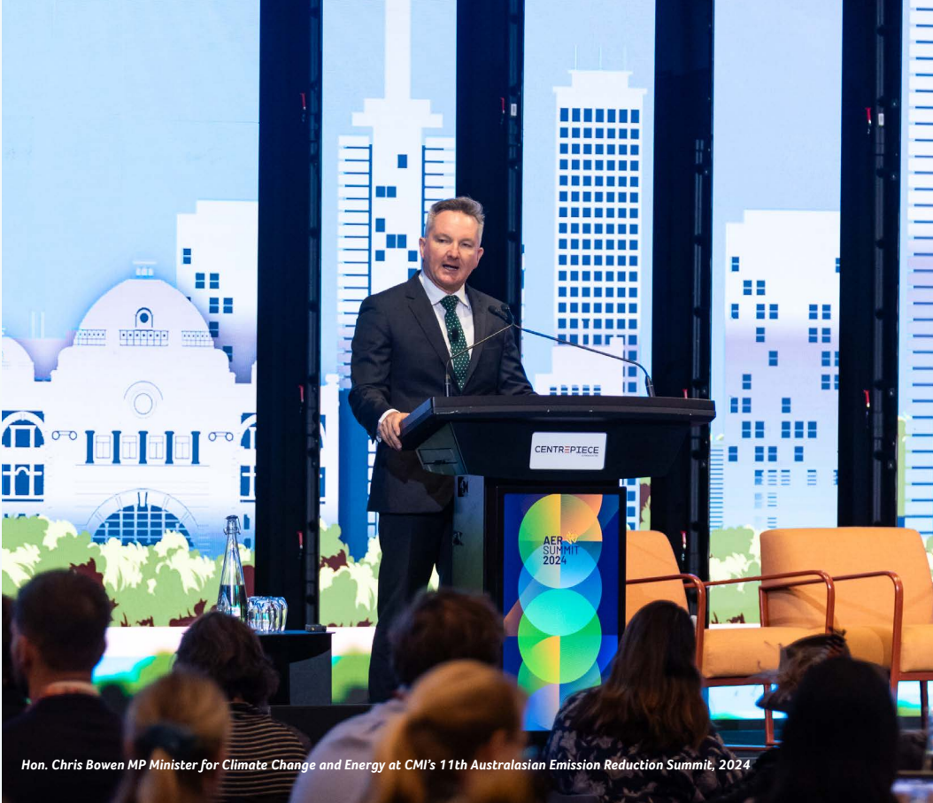
Hon. Chris Bowen MP Minister for Climate Change and Energy at CMI's 11th Australasian Emission Reduction Summit, 2024