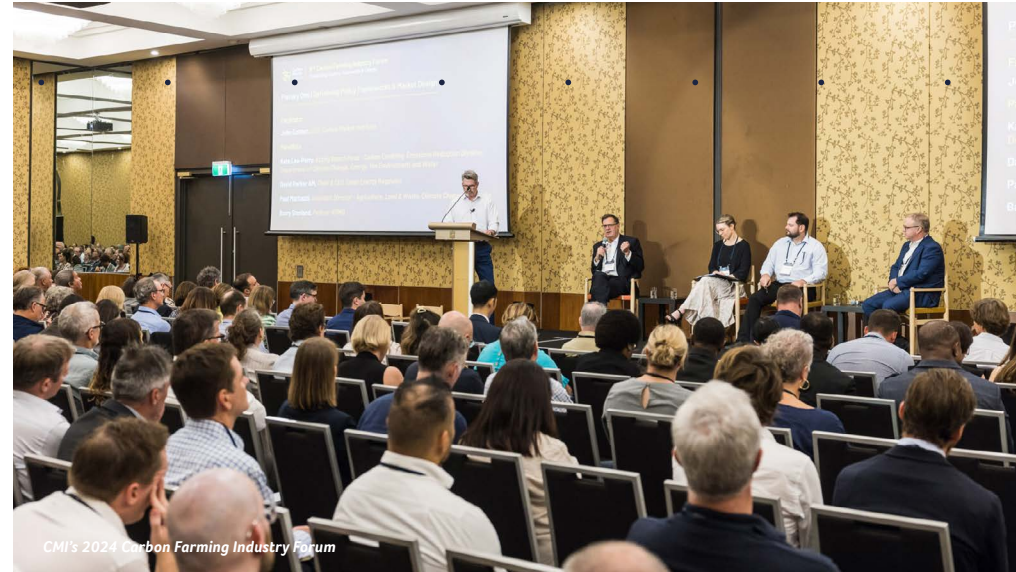
CMI's 2024 Carbon Farming Industry Forum

CMI is governed by a Constitution approved by corporate members with commercial engagement in carbon markets who also elect the board. Associate observer members also participate where appropriate in working group and information sharing processes.