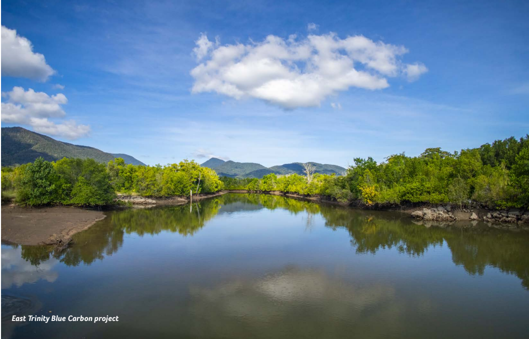
East Trinity Blue Carbon project