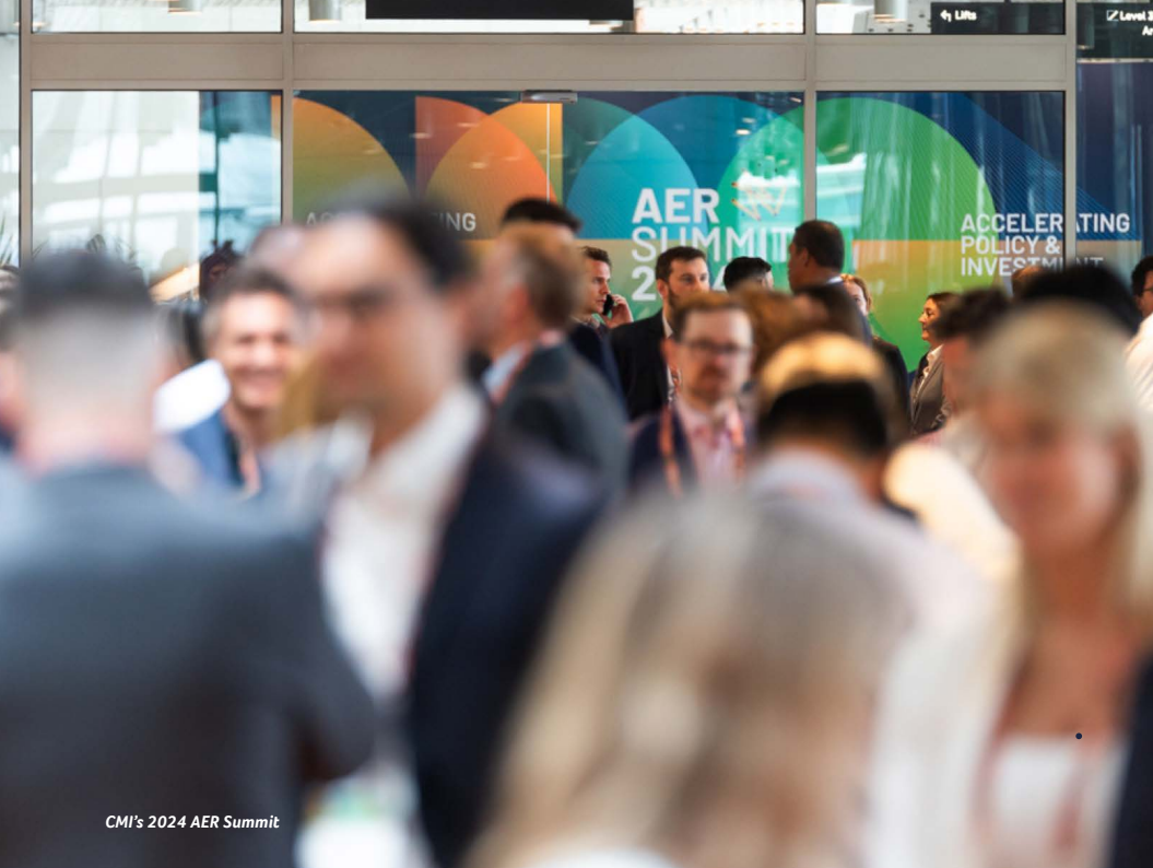
CMI's 2024 AER Summit