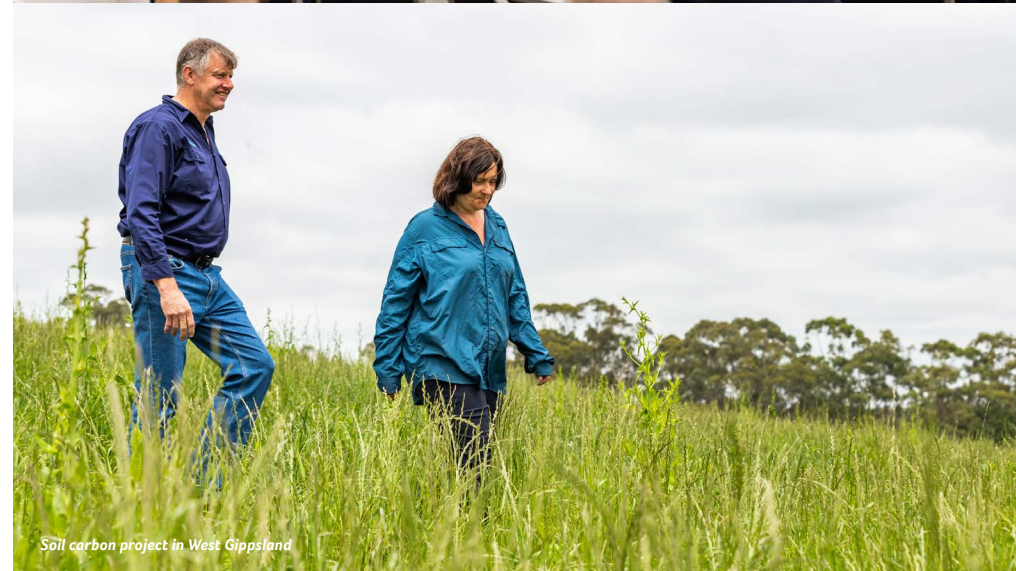
Soil carbon project in West Gippsland