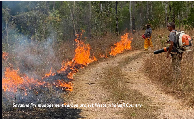
Savanna fire management carbon project Western Yalanji Country