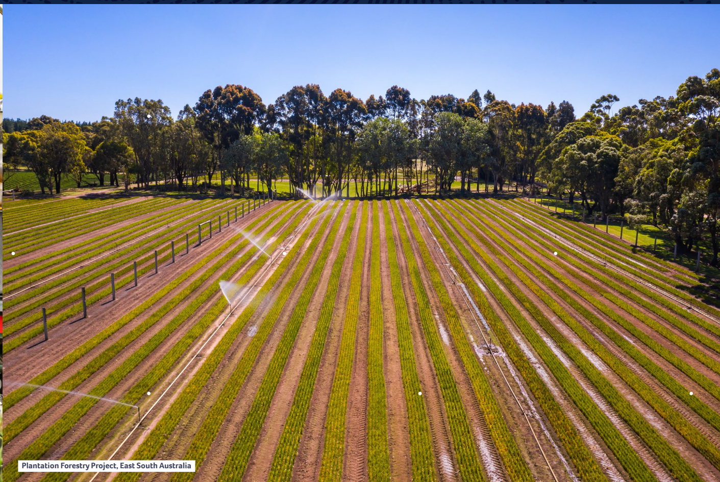
Plantation Forestry Project, East South Australia