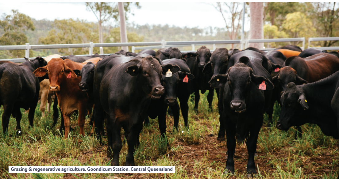
Grazing & regenerative agriculture, Goondicum Station, Central Queensland

This invite only annual Forum is an unique and exclusive opportunity to meet representatives of State and Federal government agencies; Indigenous carbon industry and land management leaders; agricultural and natural resource management organisations; carbon project developers; agricultural, information and geo-spatial technology innovators; emissions intensive and other demand side corporate entities; as well as banks, financiers and other strategic advisers.