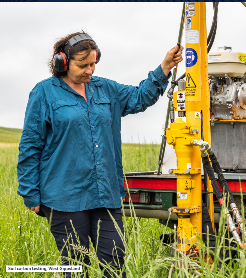
Soil carbon testing, West Gippsland