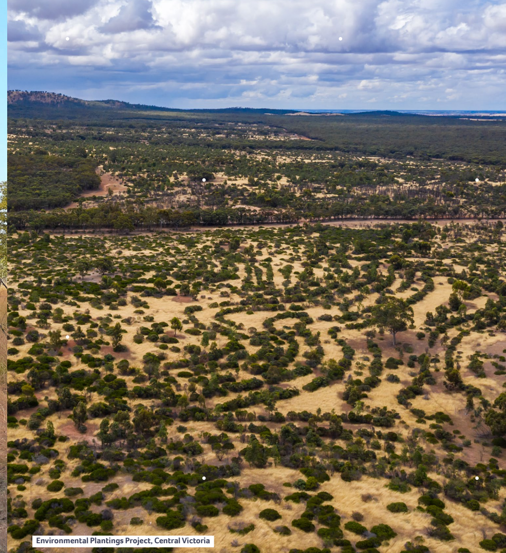
Environmental Plantings Project, Central Victoria