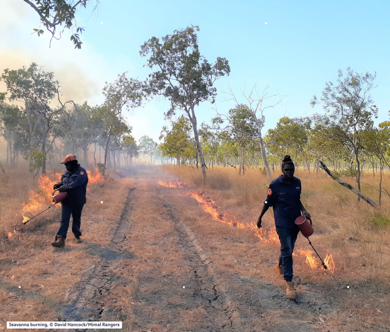
Ssavanna burning